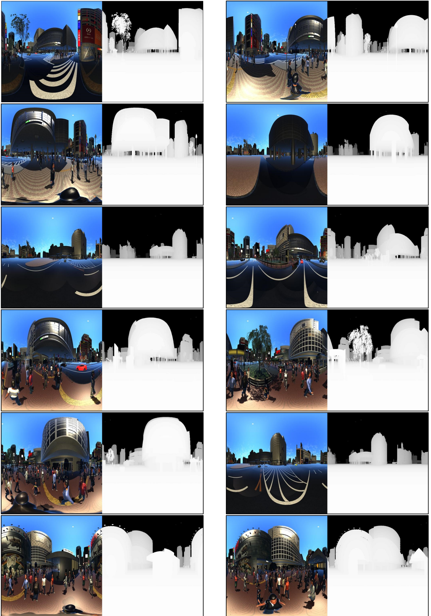
Figure 2. Sampled pairs of an omnidirectional image and its depth map shoot in Shibuya model (©NONECG) on a sunny day.