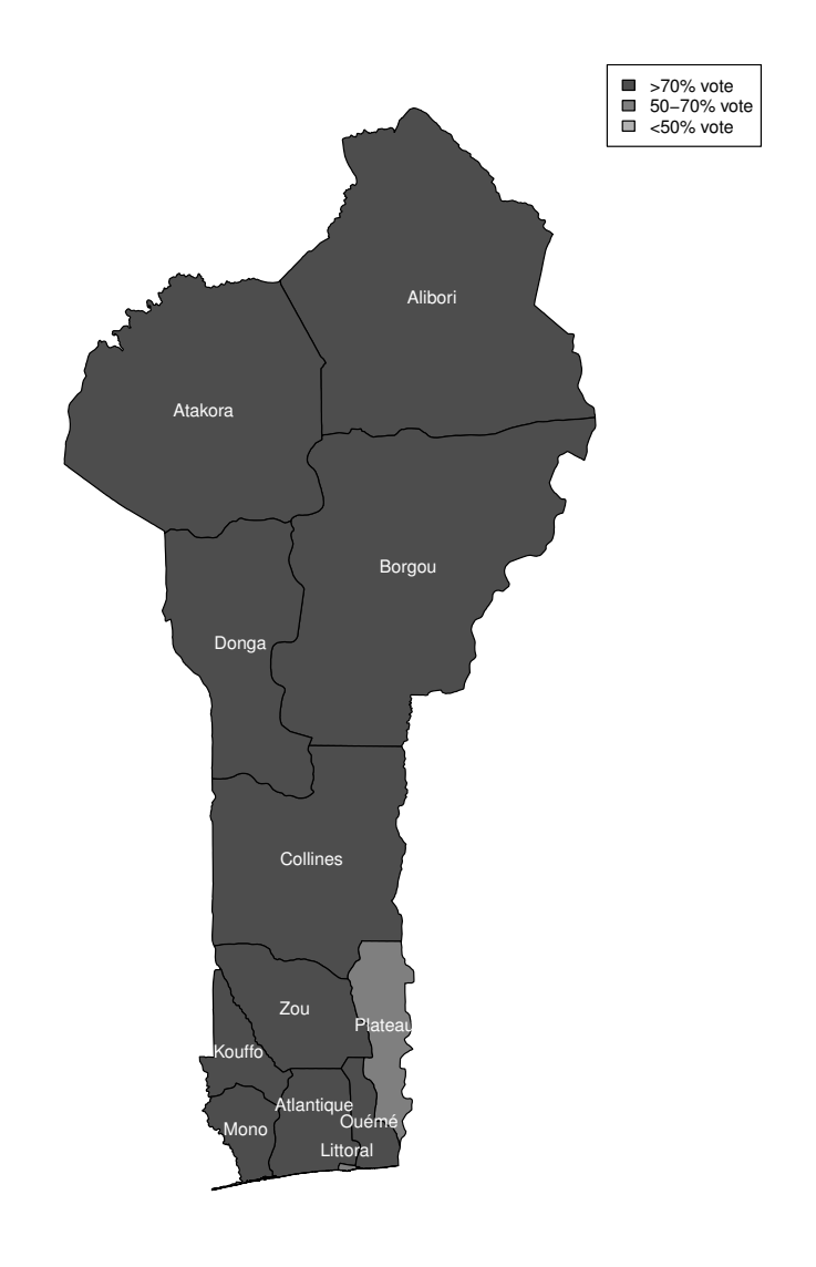
Figure SM-1: Vote for President Yayi (2006 Elections – Run-off)