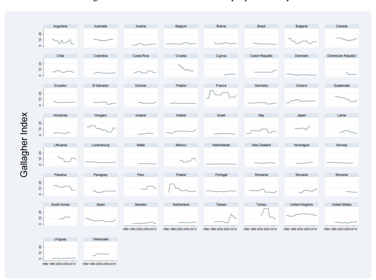
Figure A: Evolution of Electoral Disproportionality