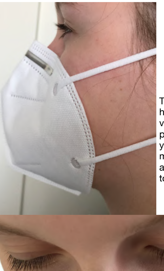
The KN95 mask, however, had a very poor fit on all participants. As you can see, the mask fits loosely and fails to confirm to the nose bridge.