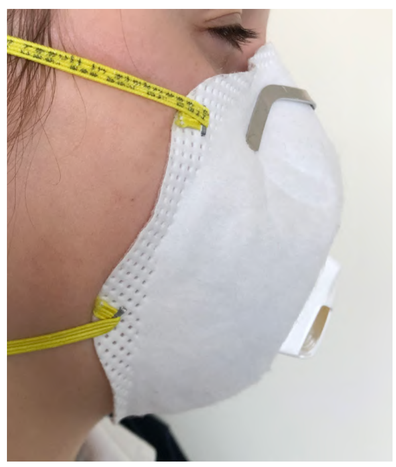
N95 mask used for testing had an excellent fit on participants 1 and 2.