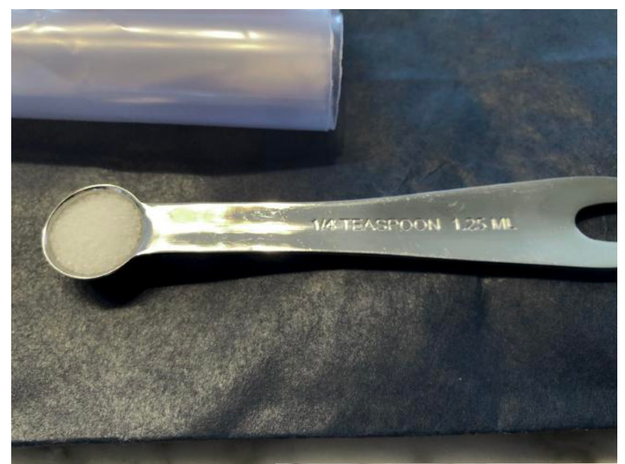
830mg of sodium saccharin measures just under 1/4 of a teaspoon. These photos show how 830mg of saccharin fills a standard 1/4 teaspoon.

The supplies used for conducting a qualitative fit test with an aroma diffuser and sturdy bag shown above. Measuring cup filled with 100ml distilled water