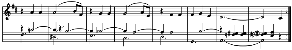
c My reading