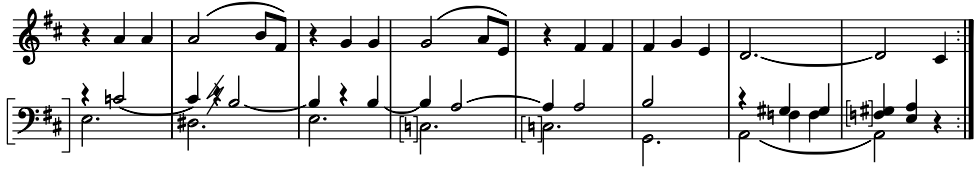
b Kinderman's transcription