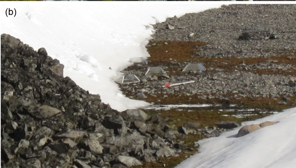
Supplementary Fig. S1. (a) An open top chamber (OTC) placed over the moss Sanionia uncinata (green) and the liverwort Cephaloziella varians (black) in the gully on Rothera Point, Adelaide island. (b) Control plots and four of the five OTCs in December, at the start of austral summer. Note how snow, which covered vegetation during the winter, has not accumulated in the OTCs. The fifth OTC is still covered by the receding snowbank to the left of the image.