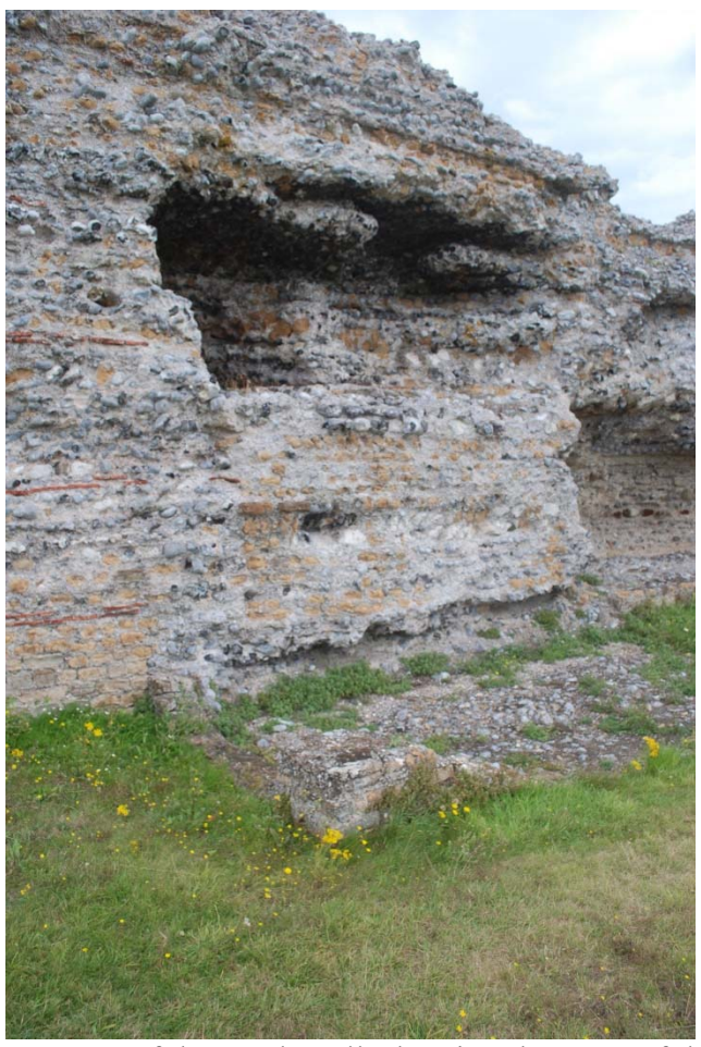
ONLINE FIG. 4. The east tower of the south wall, showing the scars of the robbed side walls, the base of the tower and the interrupted tile courses.