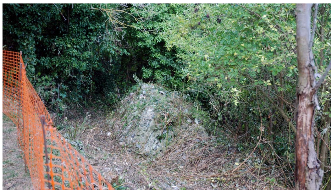
ONLINE FIG. 2. Fallen wall covered in vegetation, 2008.