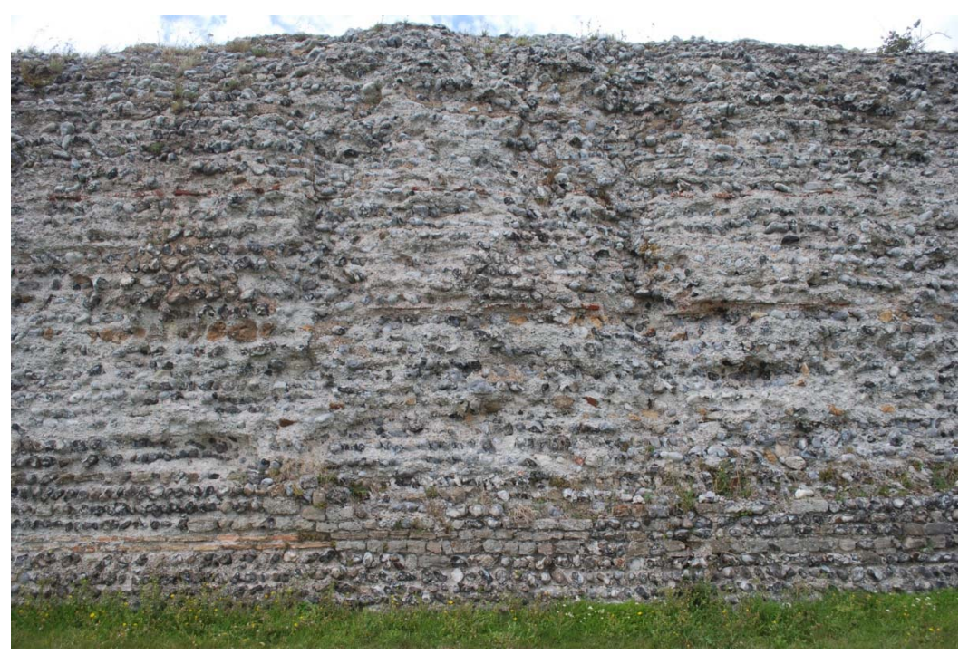
ONLINE FIG. 6. An area of the internal (south) face of the north wall of the fort, showing uneven vertical scarring and changes in facing similar to those on the supposed east interval tower.