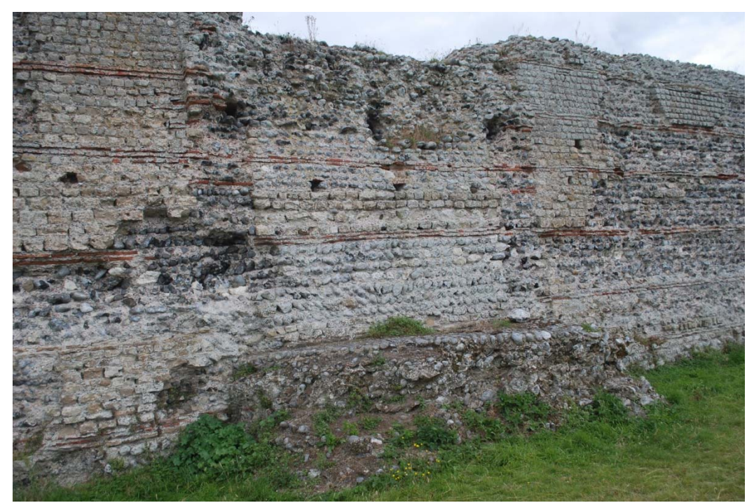
ONLINE FIG. 3. The west tower of the north wall, showing the scars of the robbed side walls and the base of the tower, and the uninterrupted tile courses that show the scars of robbed side walls. Note that the second tile course from the bottom is interrupted within the walls of the tower, where a repair to the wall face has been effected.