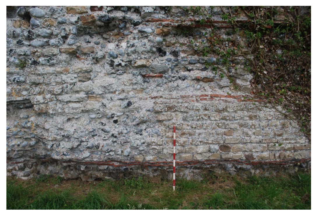
ONLINE FIG. 7. The western edge of the supposed east interval tower. The facing above the bottom tile course is flush, with no sign of a scar from a robbed side wall to a tower.