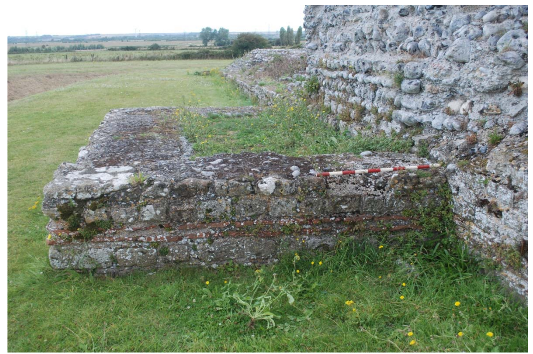
ONLINE FIG. 5. The base of the north tower of the west wall, showing the tile courses carried continuously around the exterior face of the tower.