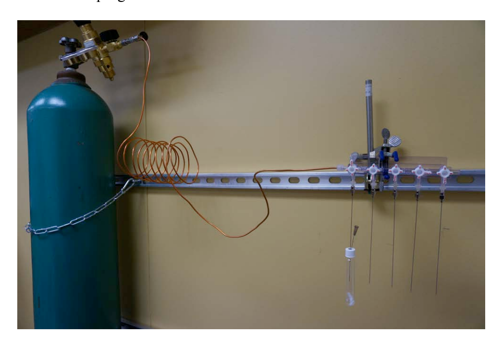
8. Purging vials with Helium using disposable tips