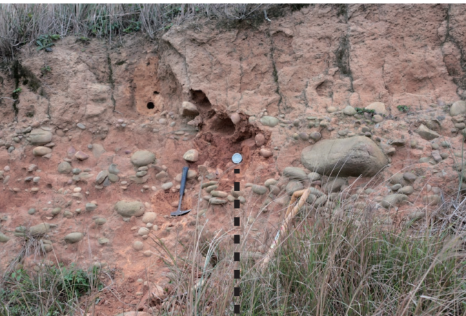
TKD-2 16.4 \pm 1.2 ka