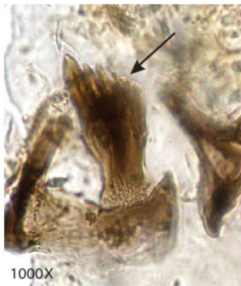
II. Ligule Apsectrotanytus