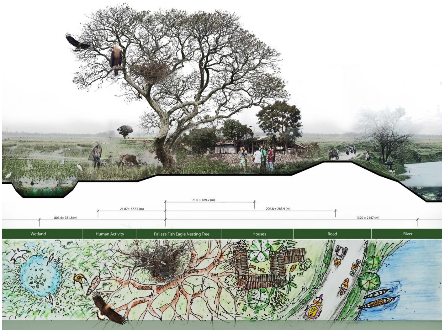
SUPPLEMENTARY FIG. 2 Graphical representation of a Pallas's fish eagle nest site and habitat characteristics, with distances (mean \pm SD, n = 53 ) to wetland, human activity, houses, road and river.