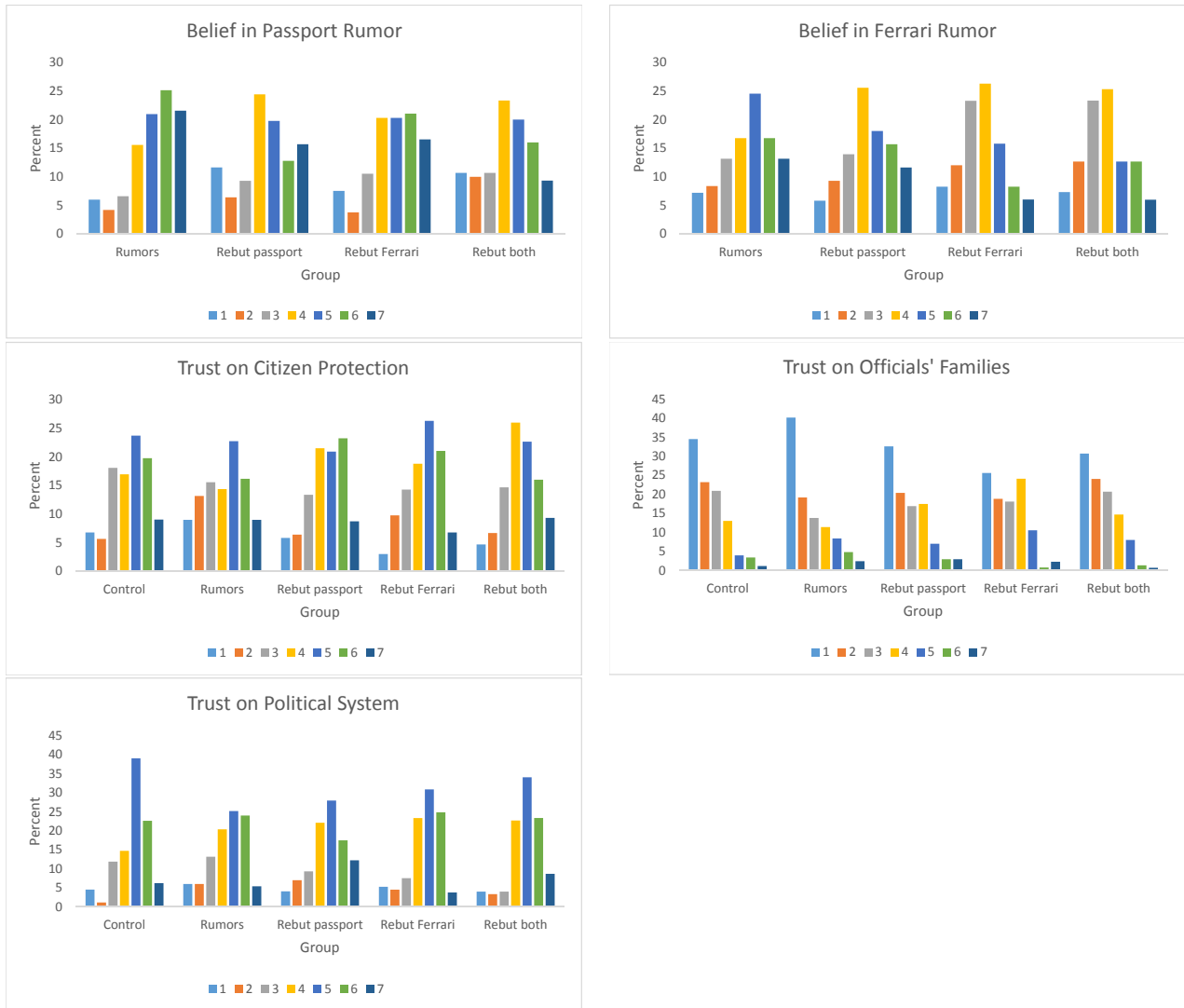
Figure S2: Distributions of Rumor Belief and Political Trust in Each Group (Experiment 2)