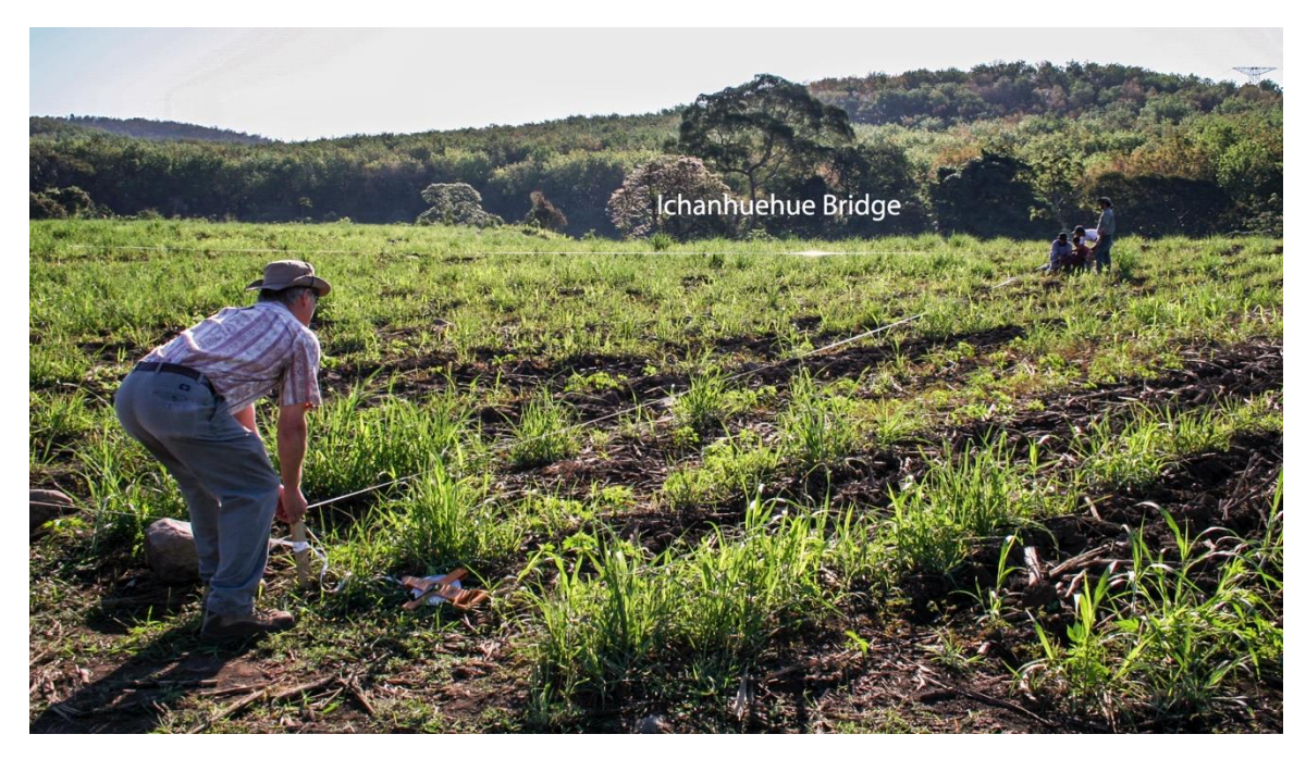
Figure S2. View to the east, showing the location of the Ichanhuehue bridge across the river gorge in the background while the GPR quadrangle is being measured out.