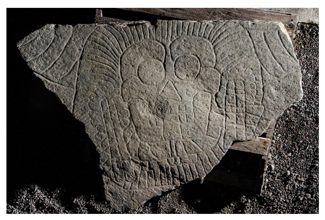
Figure S4. El Baúl monument 76 showing the Cotzumalhuapa god of death.