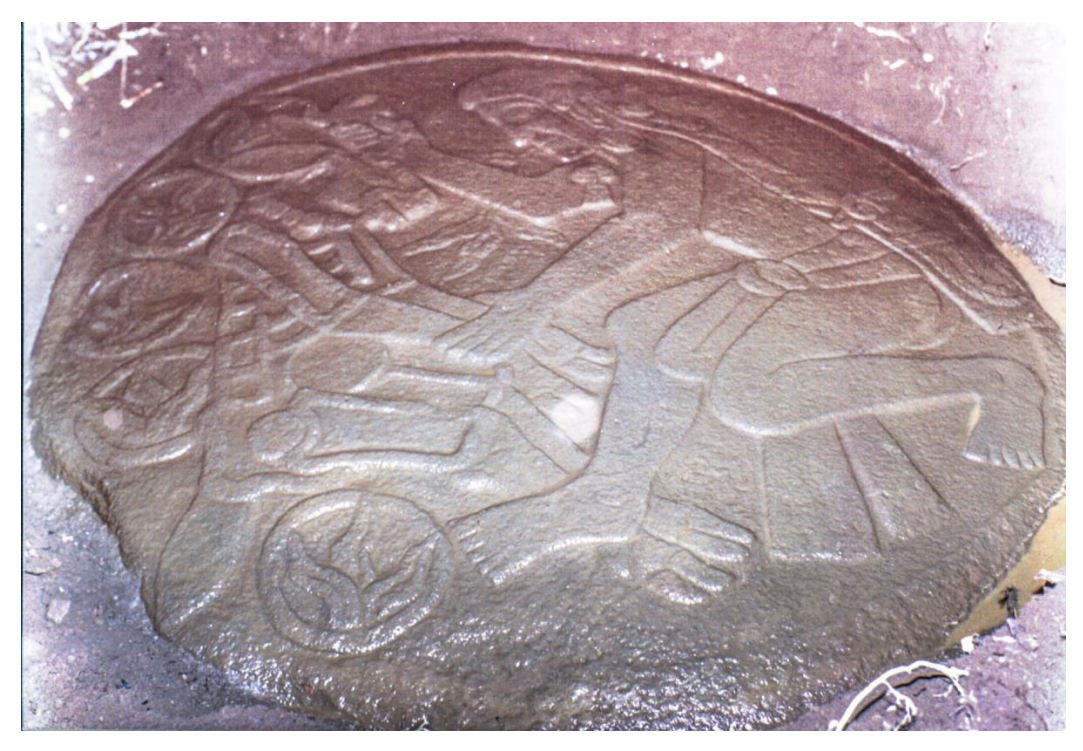
Figure S5. Sculpture found in the Ichanhuehue sector, east of the Santiago River.