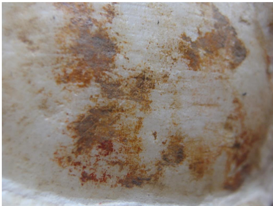
Figure S1. Athena Parthenos, detail of the helmet's cap.

* Author for correspondence (Email: elisabetta.neri@unicatt.it)