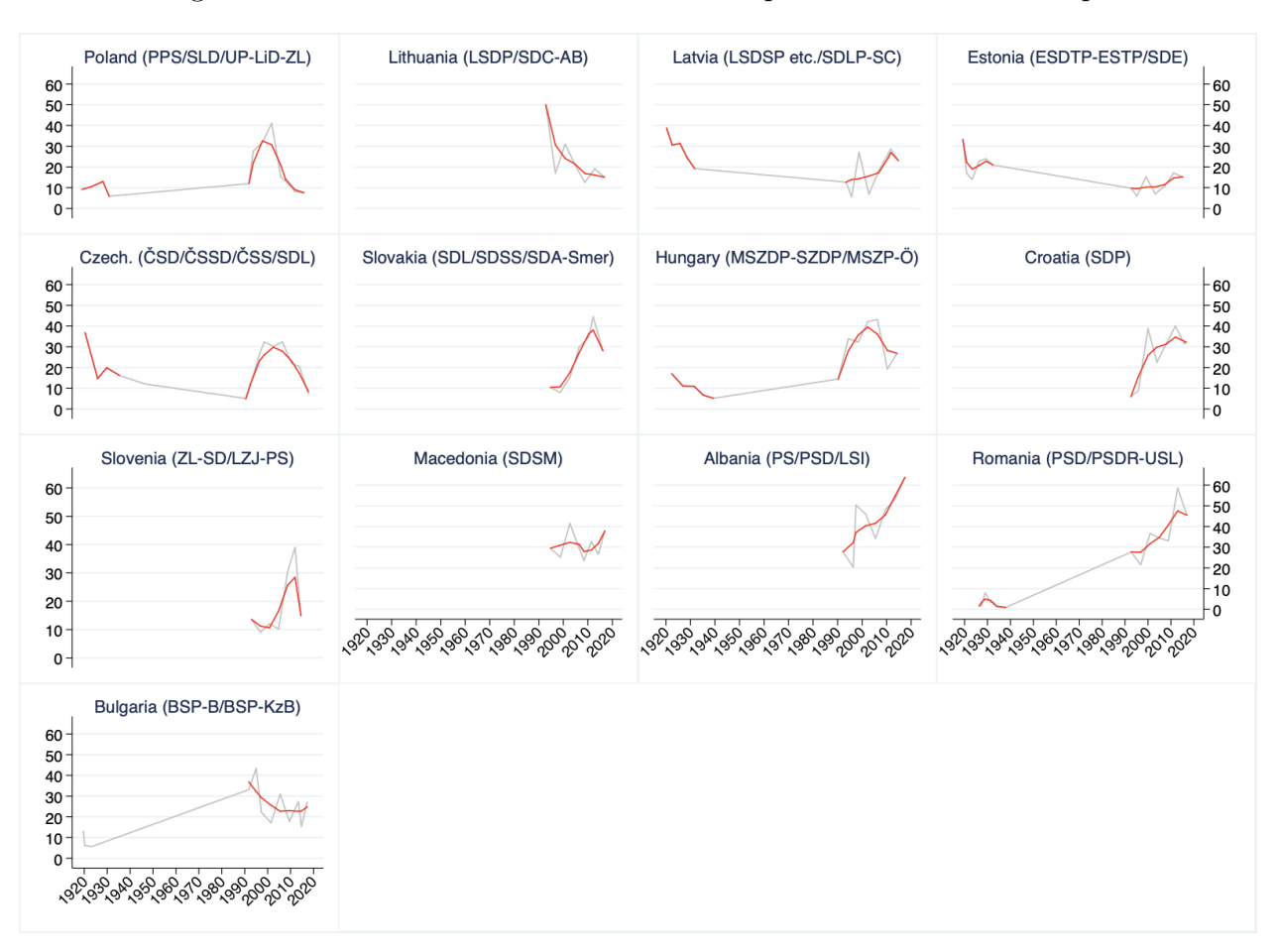
Figure A2: Vote shares of social democratic parties in Eastern Europe