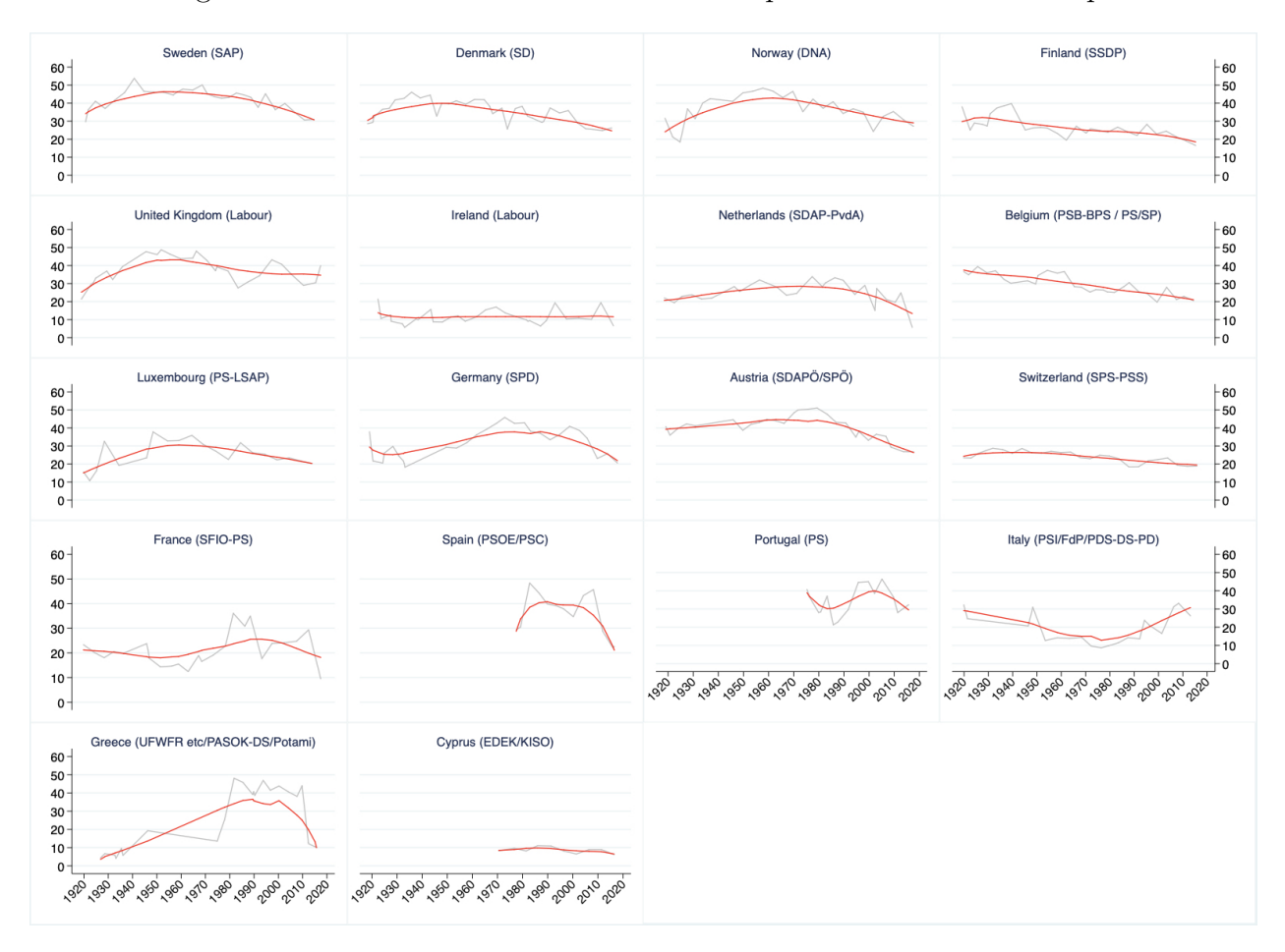
Figure A1: Vote shares of social democratic parties in Western Europe