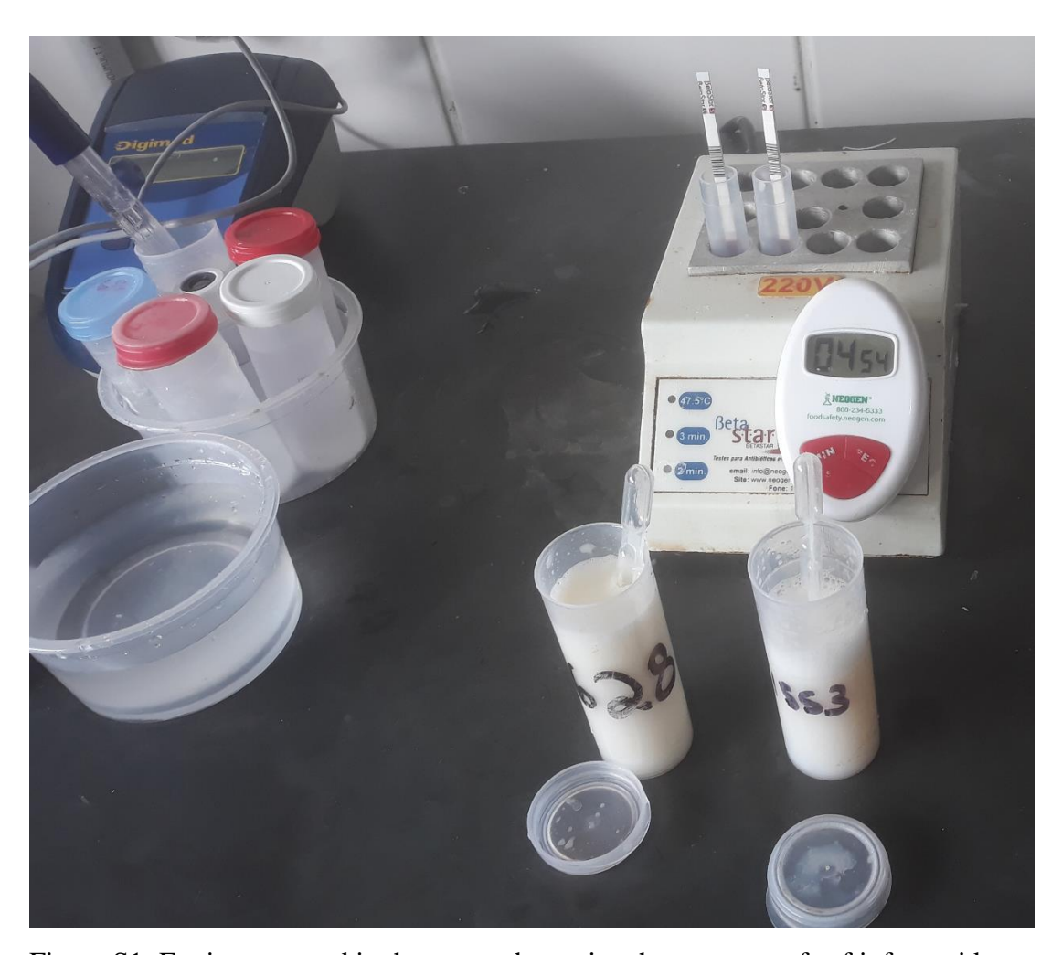
Figure S1: Equipment used in the test to determine the presence of ceftiofur residues.