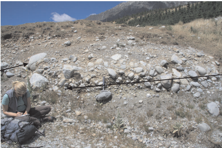
unit 5-clast supported boulder