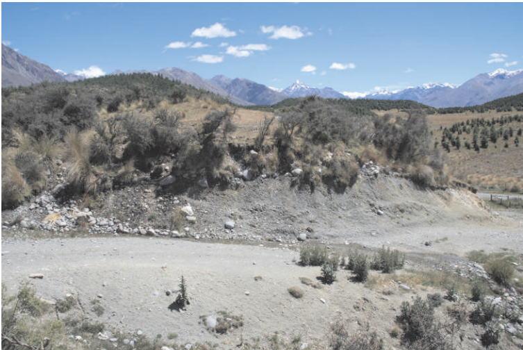
2nd rock outcrop capped by degradation gravel