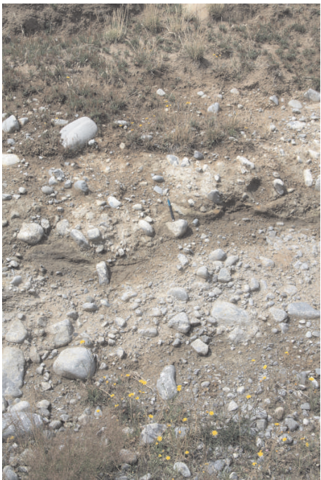
top outcrop at zig zag - unit 11?