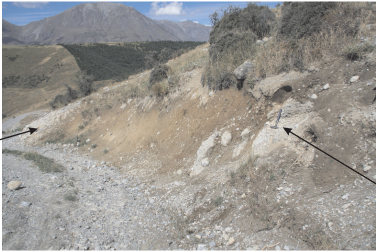
unit 9 gravels on right and looking down track towards unit 8