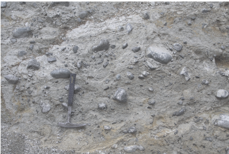
diamicton of unit 12, showing ductile flow