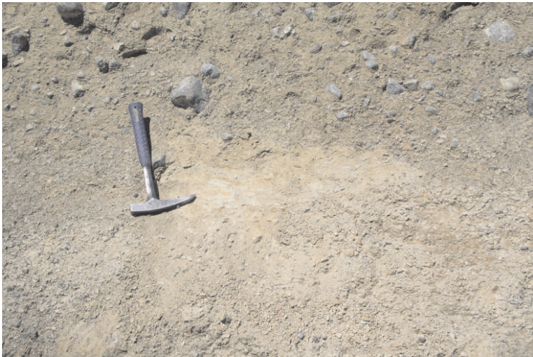
finely laminated silt - unit 2