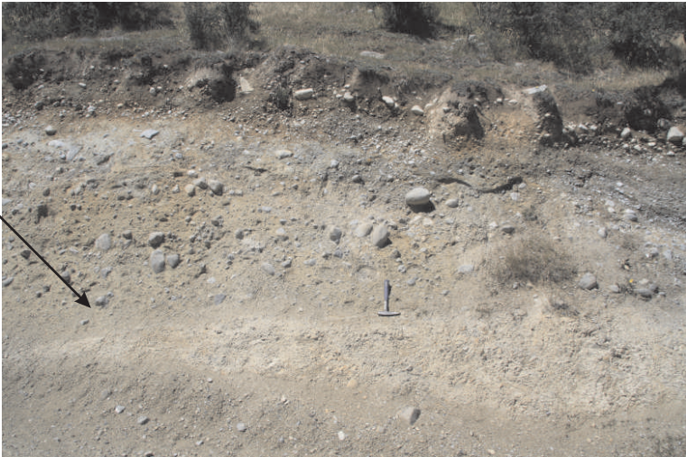
outcrop of lower units zig zag road