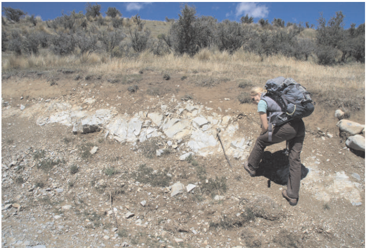
bedrock outcrop 25 m up track