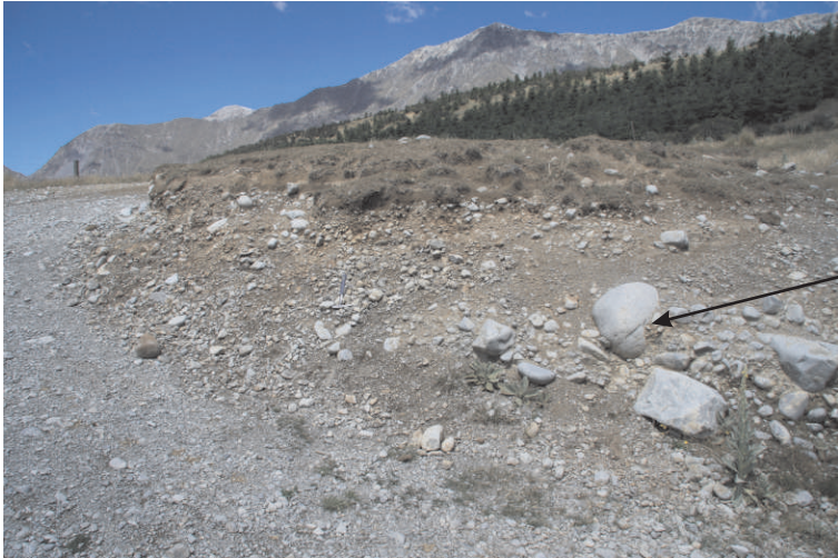
outcrop of Unit A over unit 5