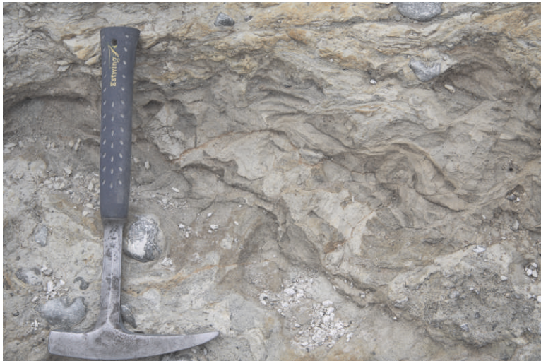
unit 12 - silty beds with small scale brittle deformation