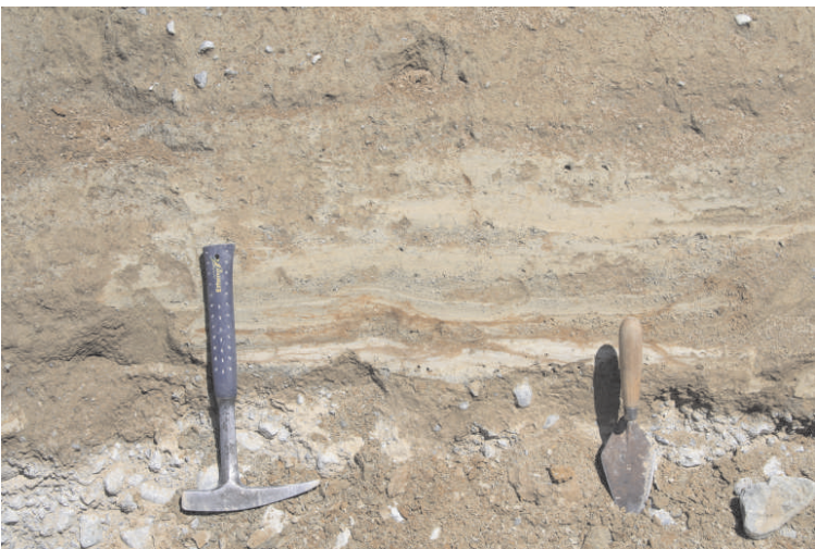
close up of laminations in unit 7