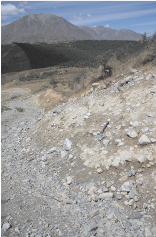
unit 8 in foreground and looking down track to units 6 & 7 (see below right)