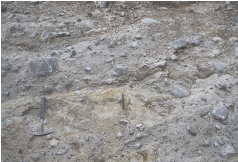
view of shear at diamicton silt contact - unit 12