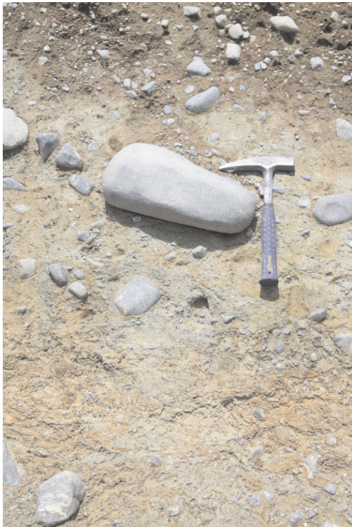
striated boulder in unit 4