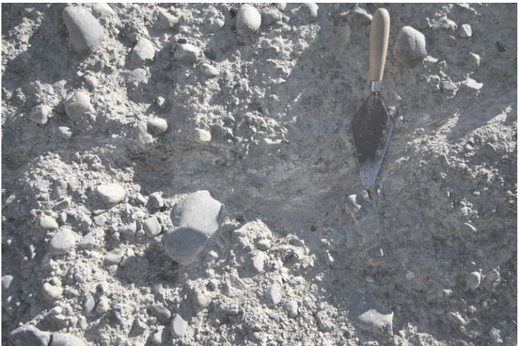
deformed silt bed in Unit 11