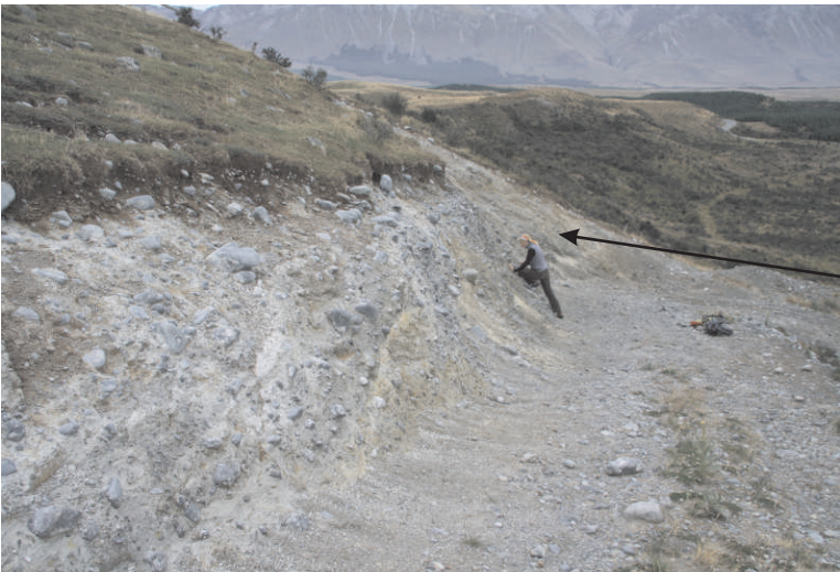
unit 12 and view down track towards underlying units 11 & 10