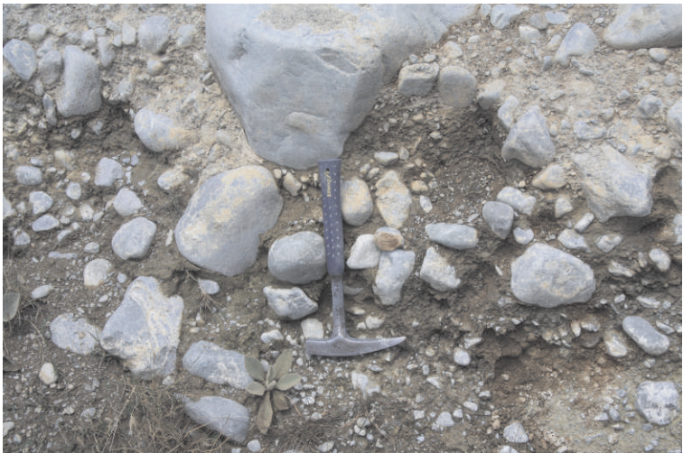
striated boulder and iron stained cobble