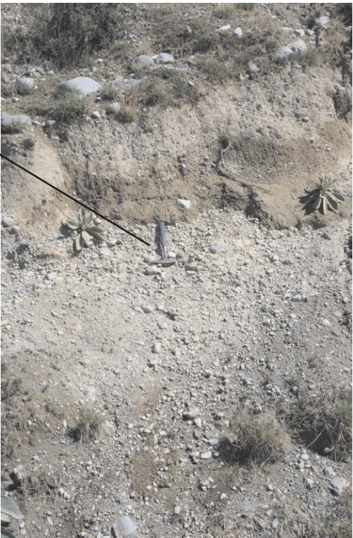
unit 9 gravels