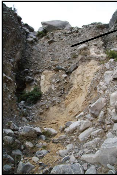
Silt/sand bed in stratified gravel - unit 4