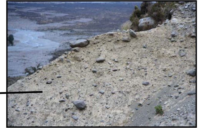
unit 6 –stratified diamicton