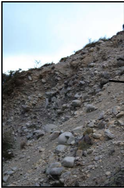
unit 7 - stratified gravel