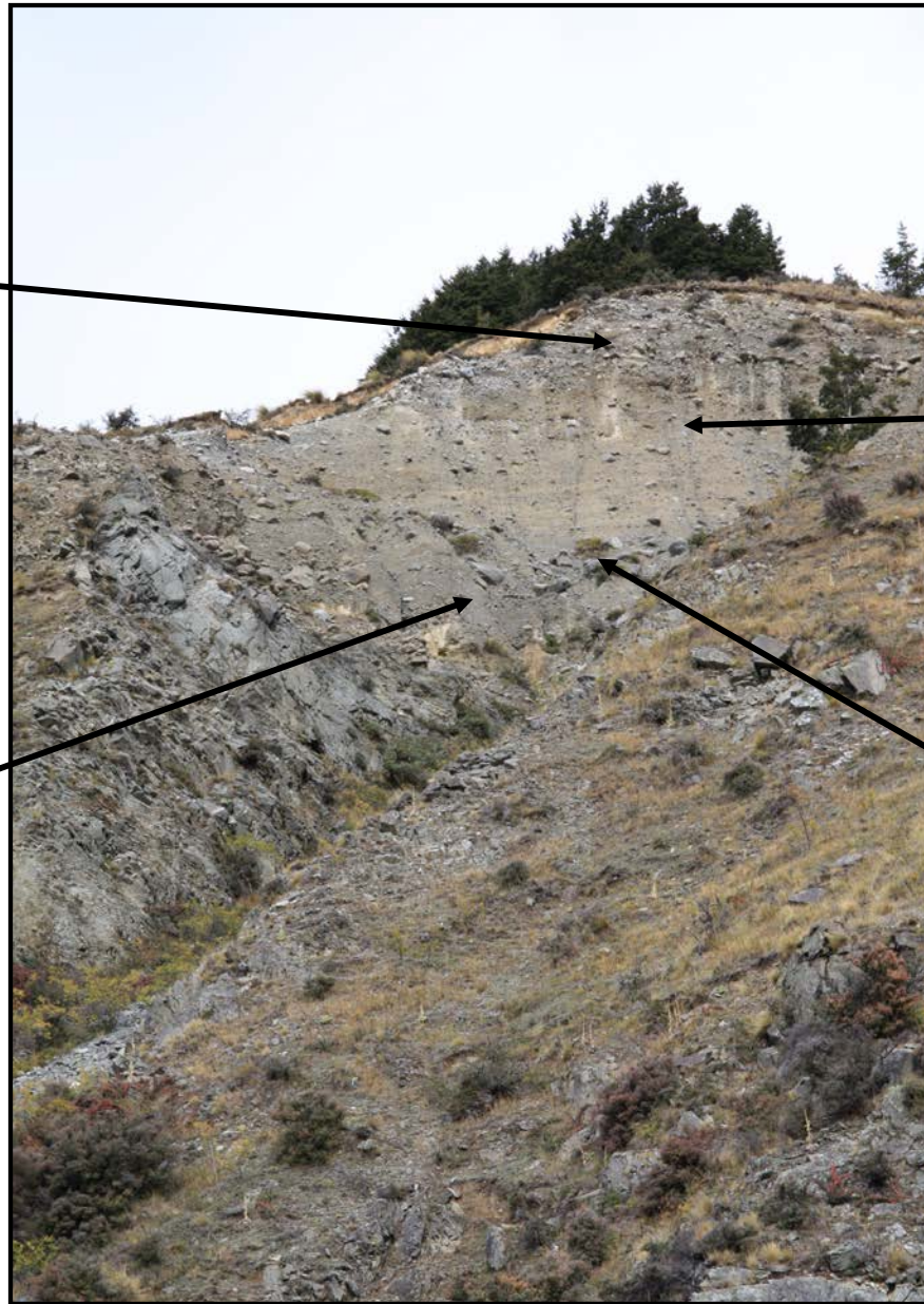
Upper part of Bush Stream section in 'deathwish' gully