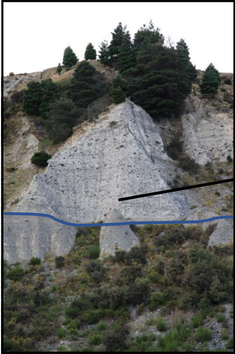
unit 3 – stratified diamicton over unit 2 – stratified gravels