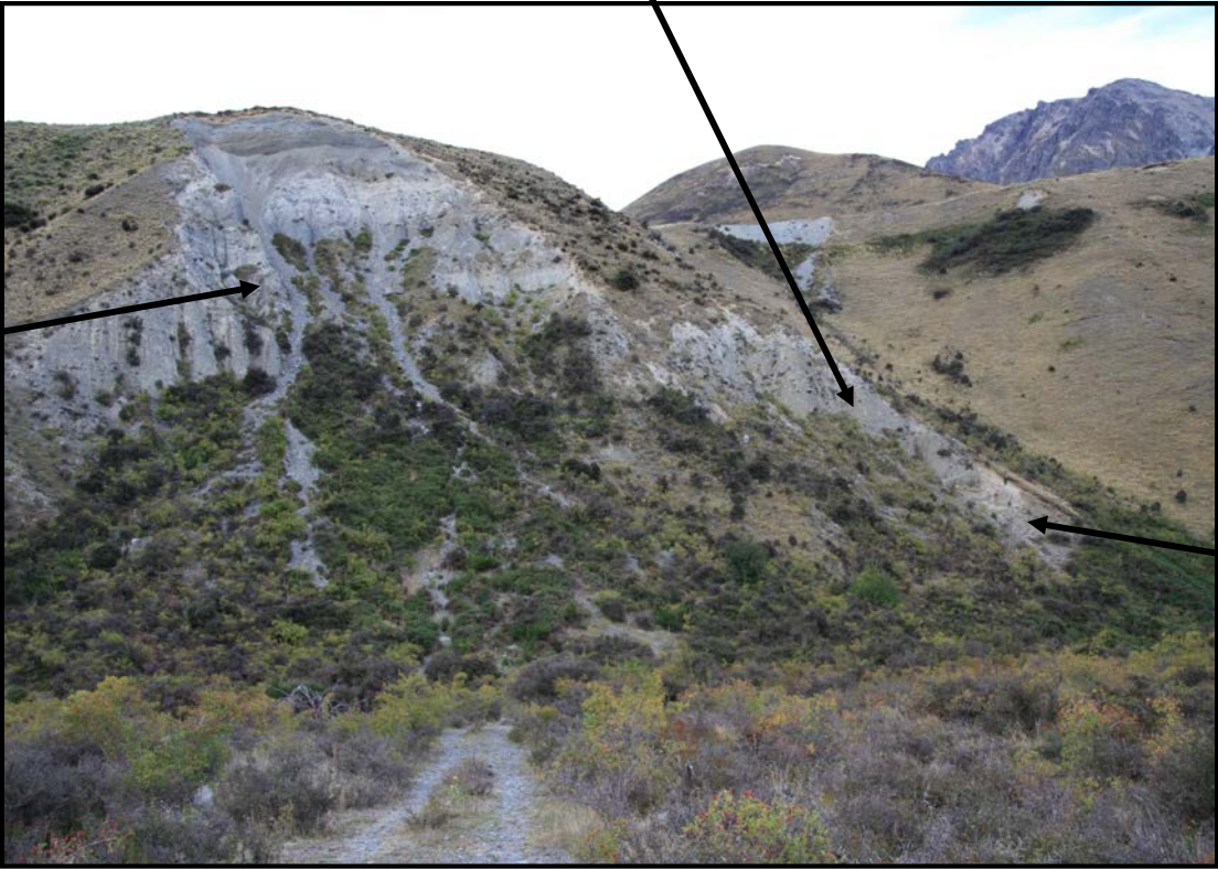
Main Bush Stream outcrop