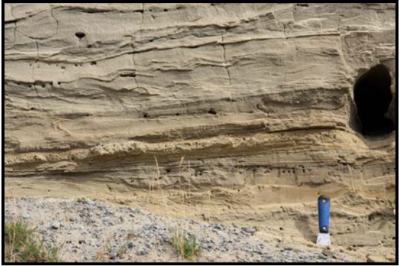
unit 1 – ripple bedded sand