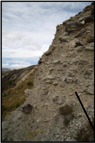
Upper part of unit 2 stratified gravels