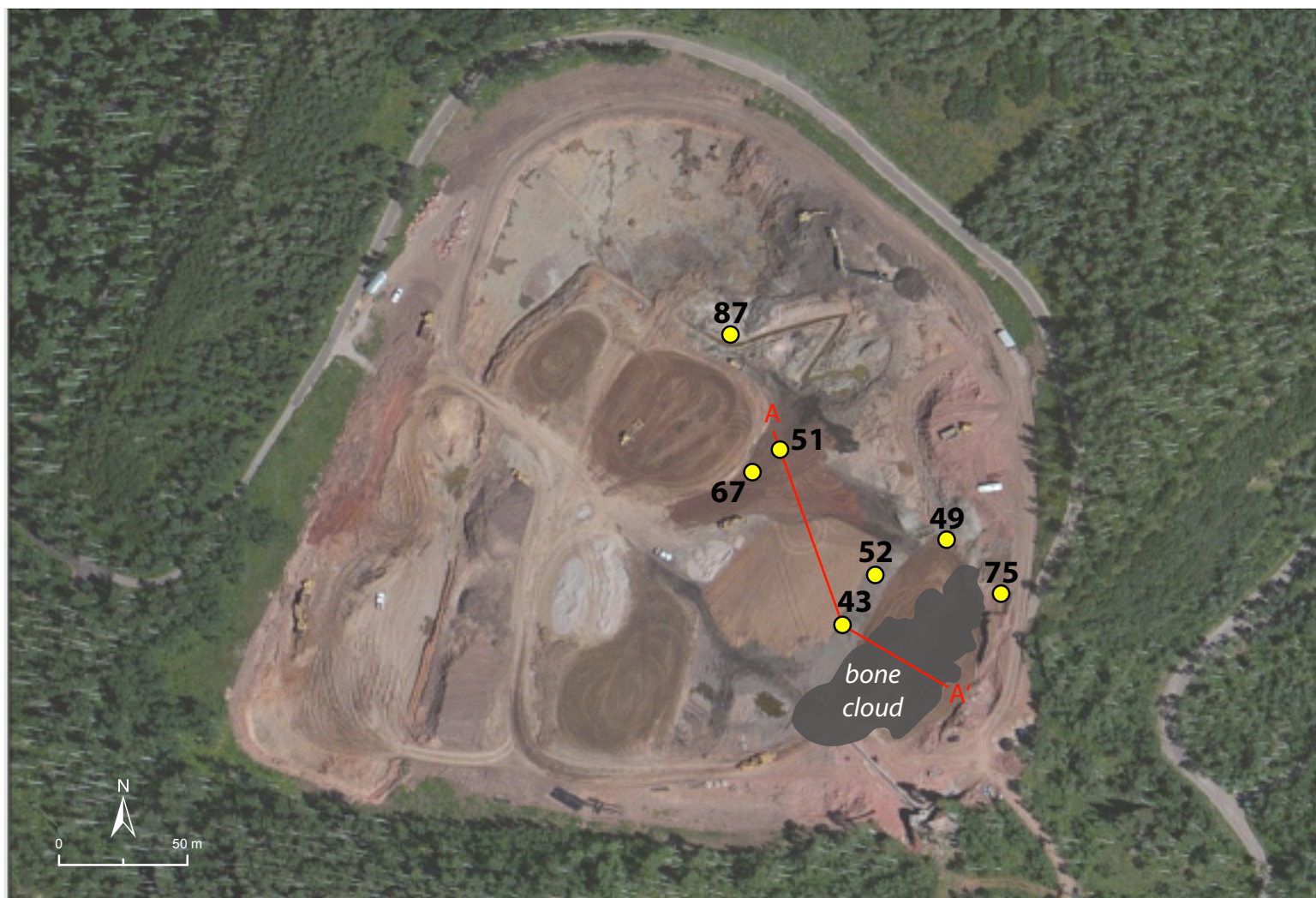
Figure S.1 Supplemental Information